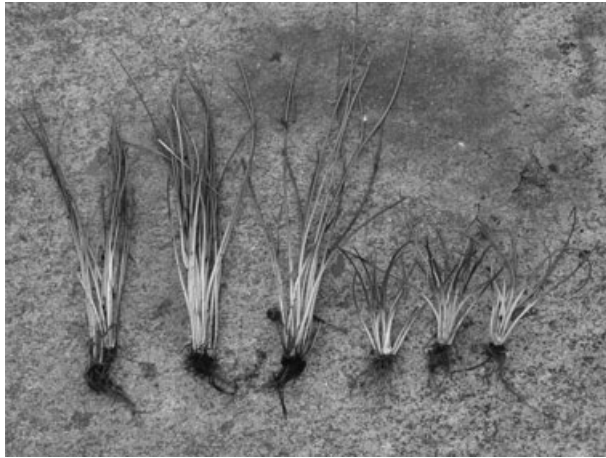
Fig. 3. Appearance of representative Isoetes lacustris plants growing on the limed (left) and control plots (right) in summer 2008.

ammonium availability in the sediment (Roelofs et al. 1995). In an ecophysiological experiment it was confirmed that J. bulbosus can only grow excessively where both parameters increase strongly (Lucassen et al. 1999). In the period 2004–2006 the concentration of \text{HCO}_3^- in the sediment pore water of the limed plots further increased and \text{NH}_4^+ concentration also temporarily increased up to 20–130 \mu\text{M} (details see Lucassen et al. 2009). Juncus bulbosus could not take advantage of this situation as cover and biomass remained unchanged. This confirms that J. bulbosus cannot profit from a higher carbon dioxide availability in the sediment by root uptake: it profits from higher carbon dioxide fluxes from the sediment to the water layer. Apparently, these fluxes remained relatively low because of the small scale to which the sediment was limed. Carbon dioxide fluxes may more easily diffuse horizontally leading to a faster decline of carbon dioxide concentrations in the deeper part of the water layer near the plants growing on the plots.